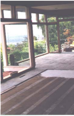
Z Mesh used in space heating of a sun room under tile.