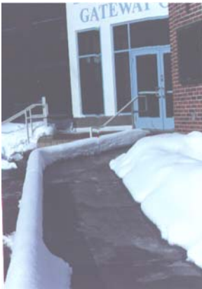
Snow melting of handicap ramp with Tuff Cable.