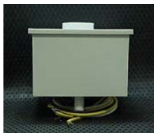
M326 Aerial Snow Switch