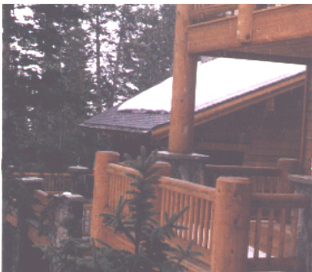
Roof de-icing with Z Mesh under asphalt shingles.